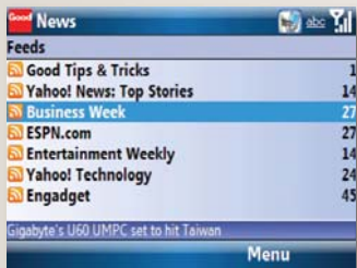
Access RSS news feeds from your inbox