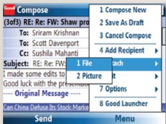
Send attachments and pictures