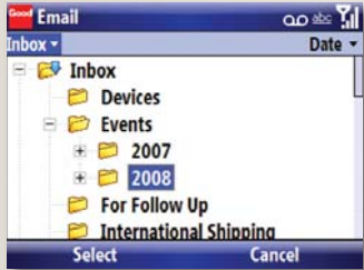
Access ALL your email, even subfolders