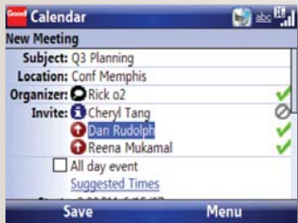
Book meetings and automatically find available conference rooms