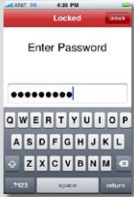
Secure enterprise data