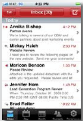
Real-time access to email